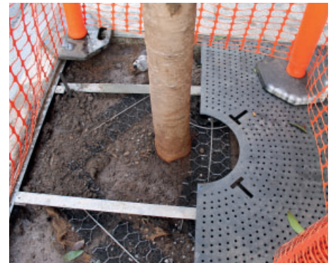
Tree Anchoring System: RF3RDMP

PDEA®, ARGs® and ARVS® are Registered Trademarks of Platipus Anchors. Platipus Anchors technology is protected by International Patents, Trademarks and Registered Copyright.